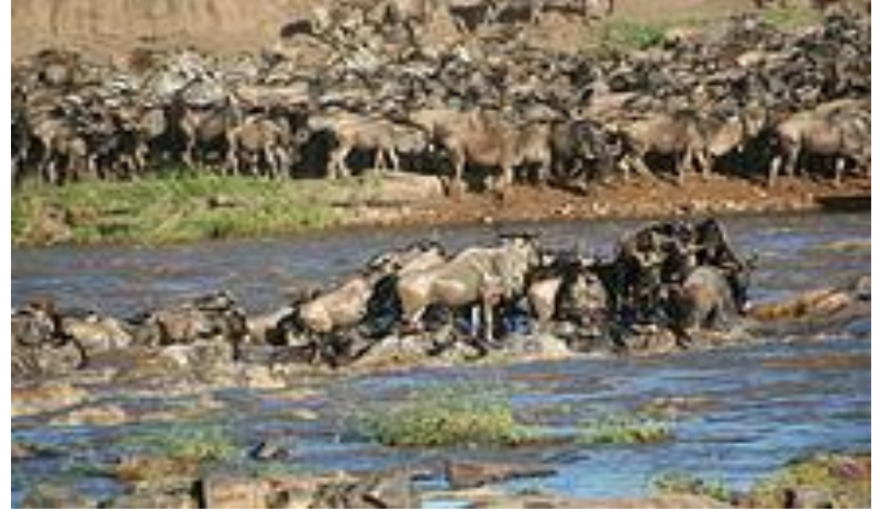
Serengeti National Park