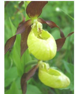
Lady's slipper orchid