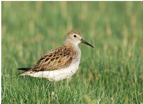
Dunlin ( Calidris alpina schinzii )