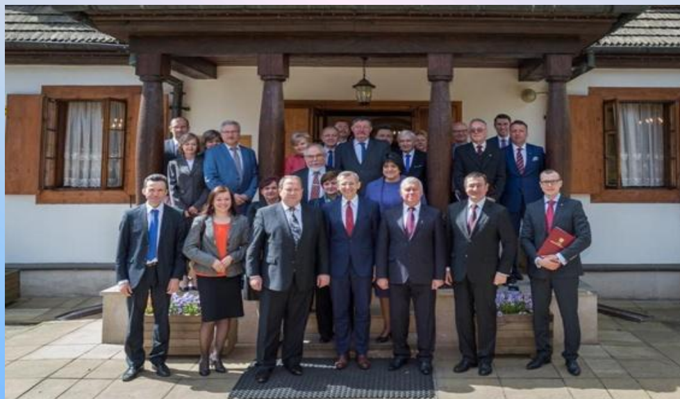
September 26-29, 2016 Skopje, the Republic of Macedonia